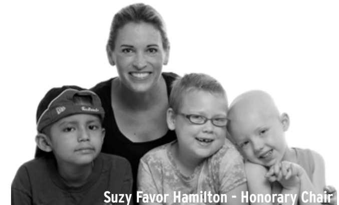
Suzy Favor Hamilton - Honorary Chair

Join Suzy Favor Hamilton & make a difference in the lives of children with cancer